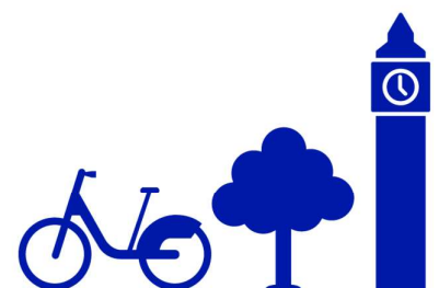
Fig 2 – monthly hires