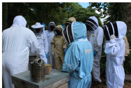
Above – Bee Keeping for Environment Week

Between the 5 and 10 June, the NLE ran an Environmental Week, where we took the opportunity to participate in local charity initiatives. One of these initiatives was with BeeUrban, a local wildlife project which raises honey bees. Staff were given the opportunity to be a bee keeper for the day, getting to know the project a little more, and meeting the newest colony of honey bees.