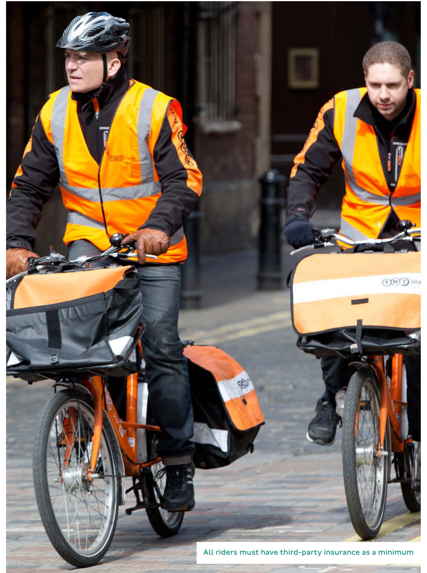
All riders must have third-party insurance as a minimum