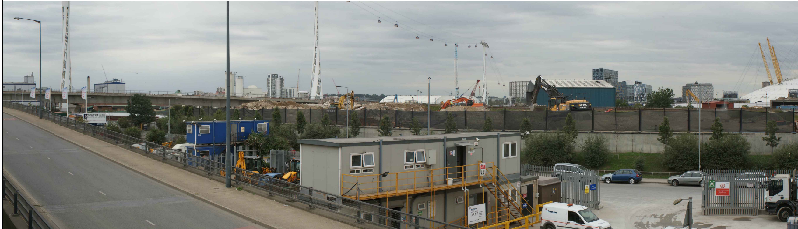
VIEWPOINT 2 - DAY TIME VIEW FROM SILVERTOWN WAY AT JUNCTION WITH LOWER LEA CROSSING, LOOKING SOUTH WEST