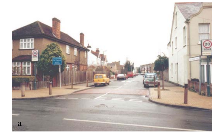
Figs 2.4a, 2.4b and 2.4c showing 20 mph zone signing and road narrowing at entrance gateway