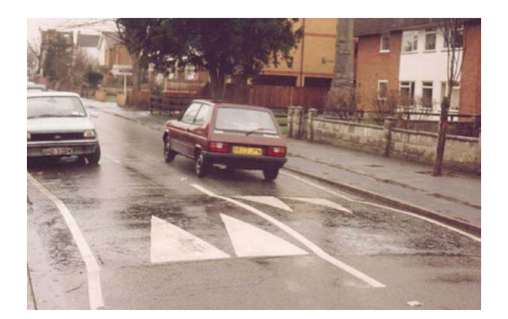
Fig 2.4d Round-top hump