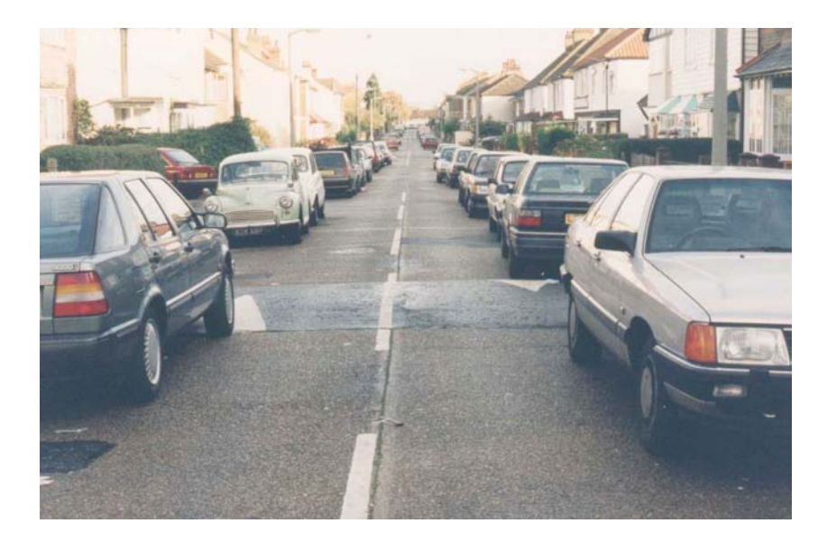
Fig 2.5c Parking along road with round-top humps

Figure 2.5 Worcester Park 20 mph zone, LB Sutton (zone 101)