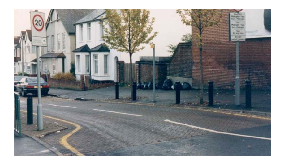
Fig 2.5a Road narrowing and signing at entry to 20 mph zone