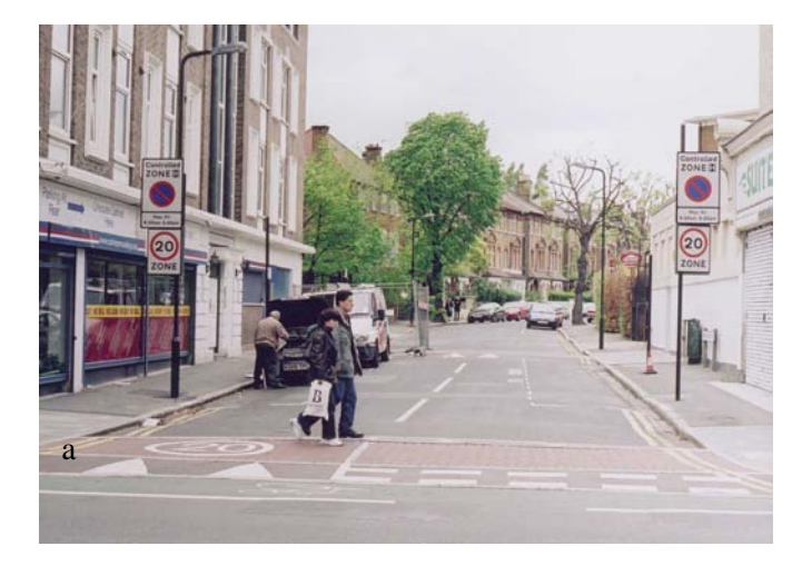
Figs 2.3a and 2.3b Signing and raised footway across entrance to 20 mph zone