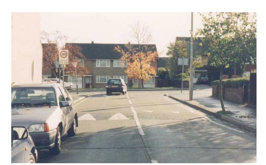
Fig 2.5b Signing on exit from the 20 mph zone