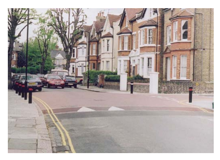
Fig 2.3c Raised junction