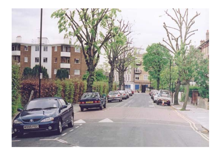
Fig 2.3d Flat-top hump and controlled parking bays

Figure 2.3 Five Roads 20 mph Zone, LB Ealing (zone 29 - first part of phased installation of Five Roads Home Zone)