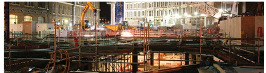
Northern ticket hall (under construction)

Phase 2 – The final phase of the redevelopment will be completed in 2010. This will deliver a new, third, 'Northern' ticket hall, new pedestrian tunnels to the Northern, Piccadilly and Victoria line platforms and a fully accessible station, with step-free access to all London Underground lines.