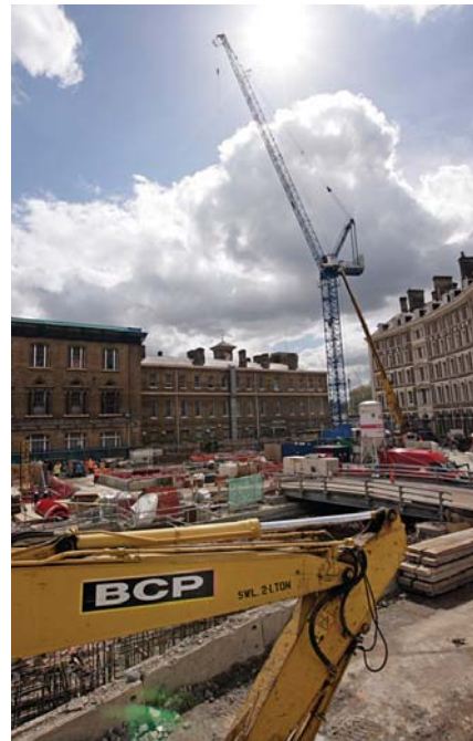
Northern ticket hall (under construction)

The next six months will also see ongoing mechanical and electrical fit-out works in the Northern ticket hall site, including ceiling services installation.