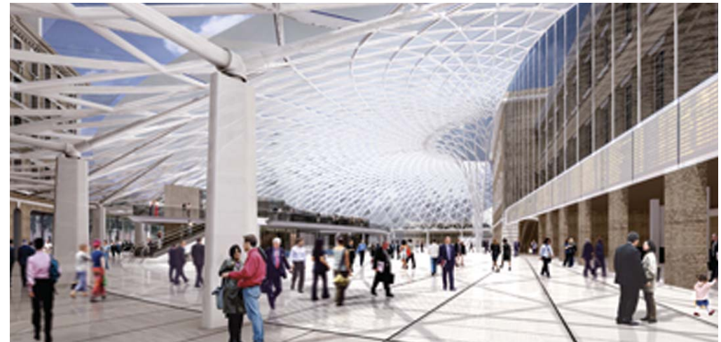
Network Rail's new Western Concourse

As part of the wider regeneration of the King's Cross area, Network Rail have commenced work on their redevelopment of King's Cross mainline station. This includes the construction of a new Western Concourse directly above the Northern ticket hall. September 2008 will see the handover of the land above the Northern ticket hall construction site so that Network Rail can begin work in this area.