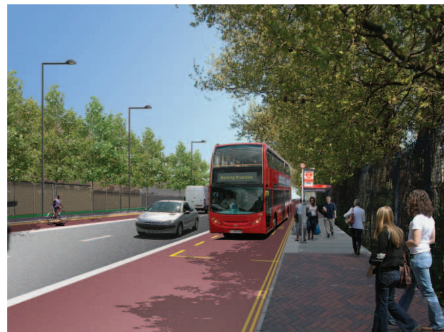
Artist's impression of River Road