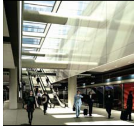
How Paddington station will look

For more information, visit tfl.gov.uk/tcr