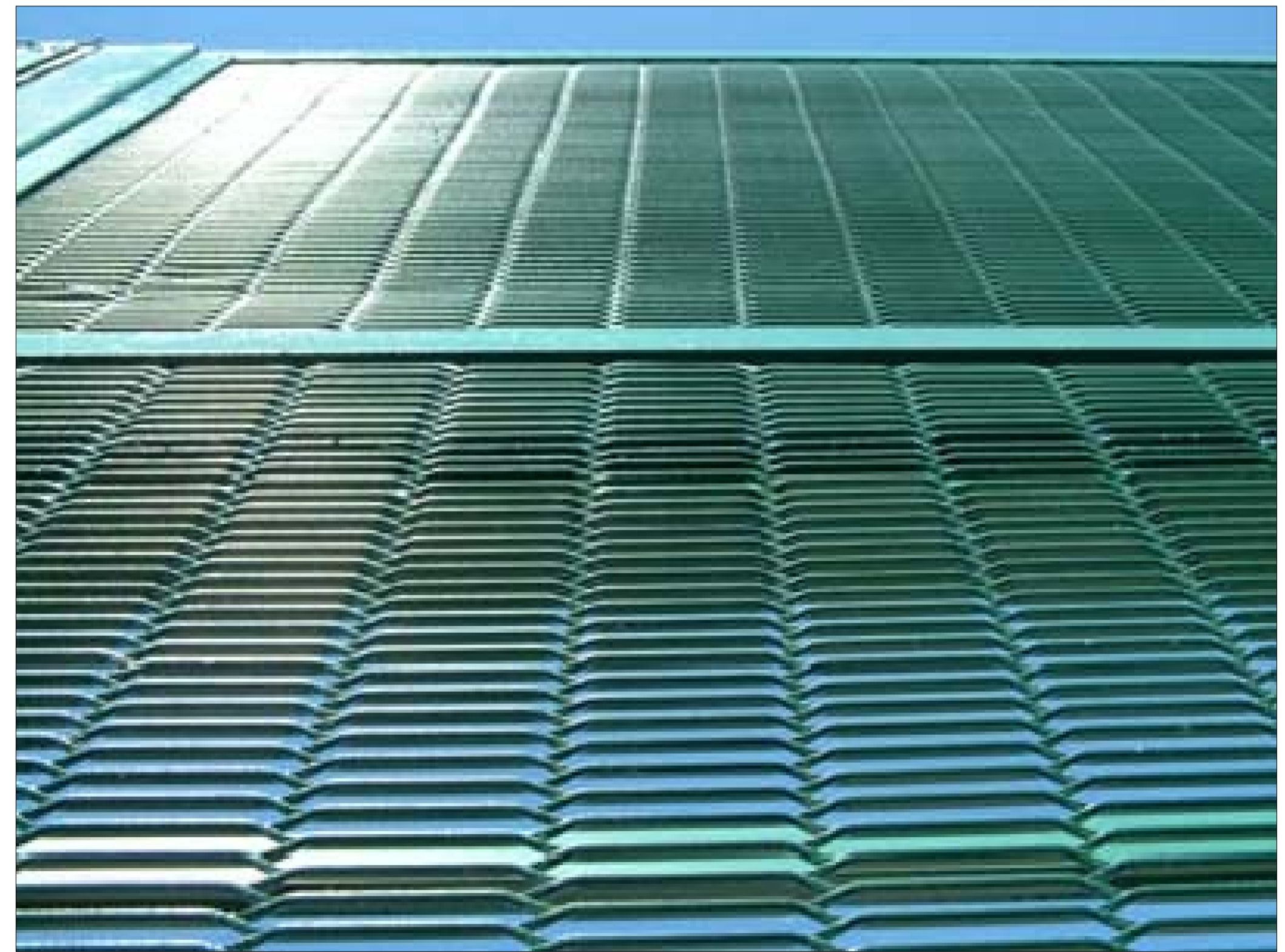
TYPICAL FENCE DETAIL