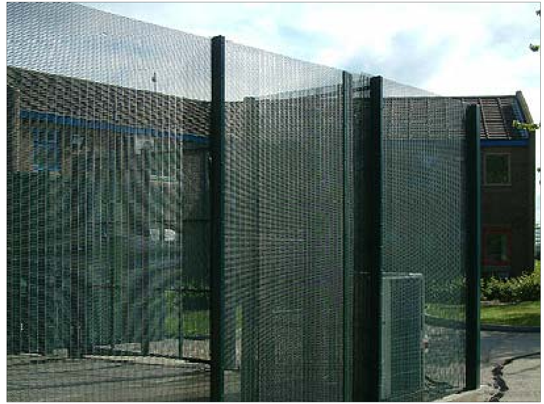
TYPICAL FENCE DETAIL