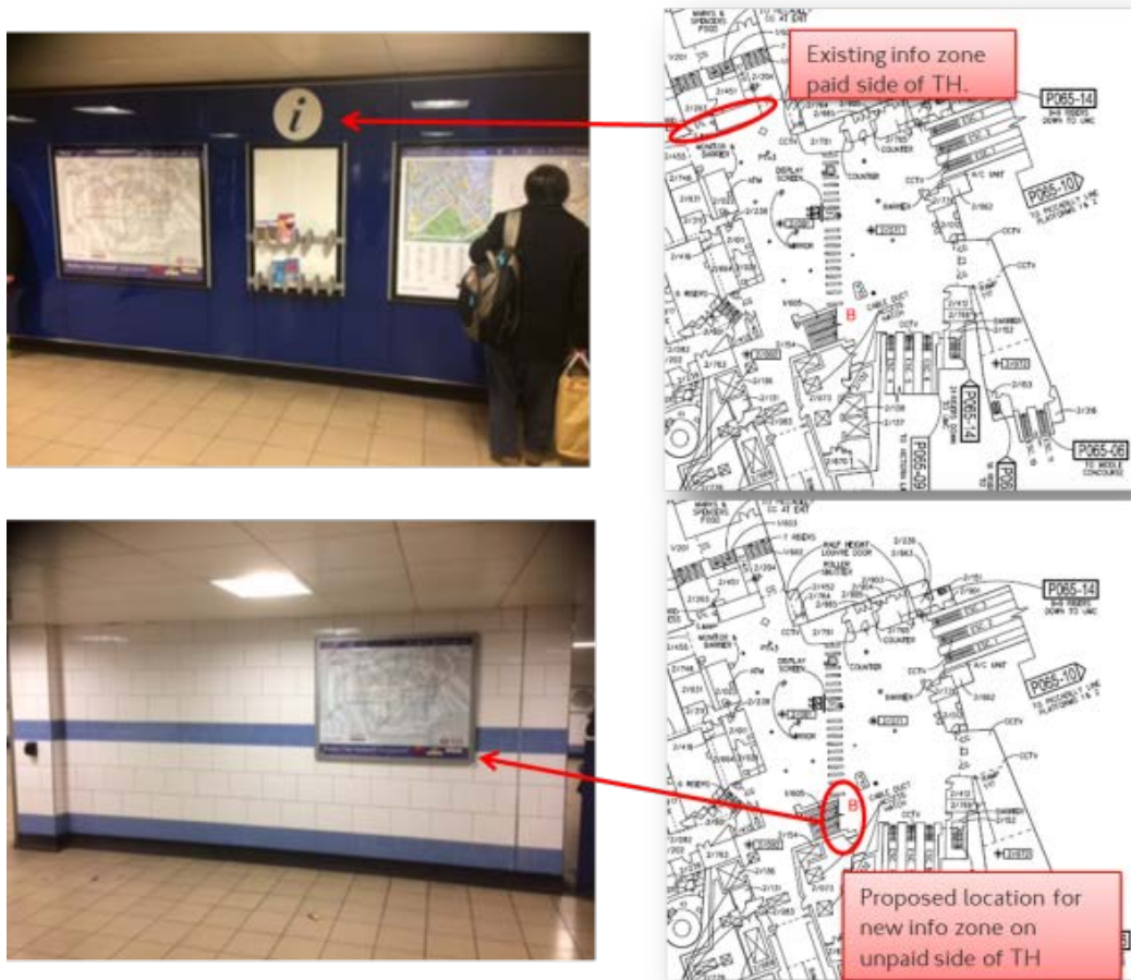
Figure 1: Customer information zone added to unpaid-side of ticket hall

Option one Red Hi-Vis vest LU Roundel, Info 'i' 'EVERY JOURNEY MATTERS'