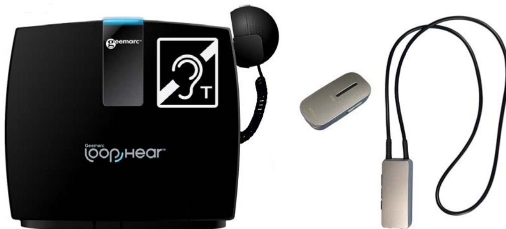
Figure 3: Variants of portable induction hearing loops – a) handheld hearing loop; b) neck loop design