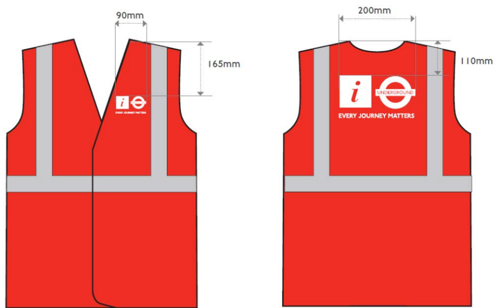
Figure 2: Red high visibility trial vest

Option one Red Hi-Vis vest LU Roundel, Info 'i' 'EVERY JOURNEY MATTERS'