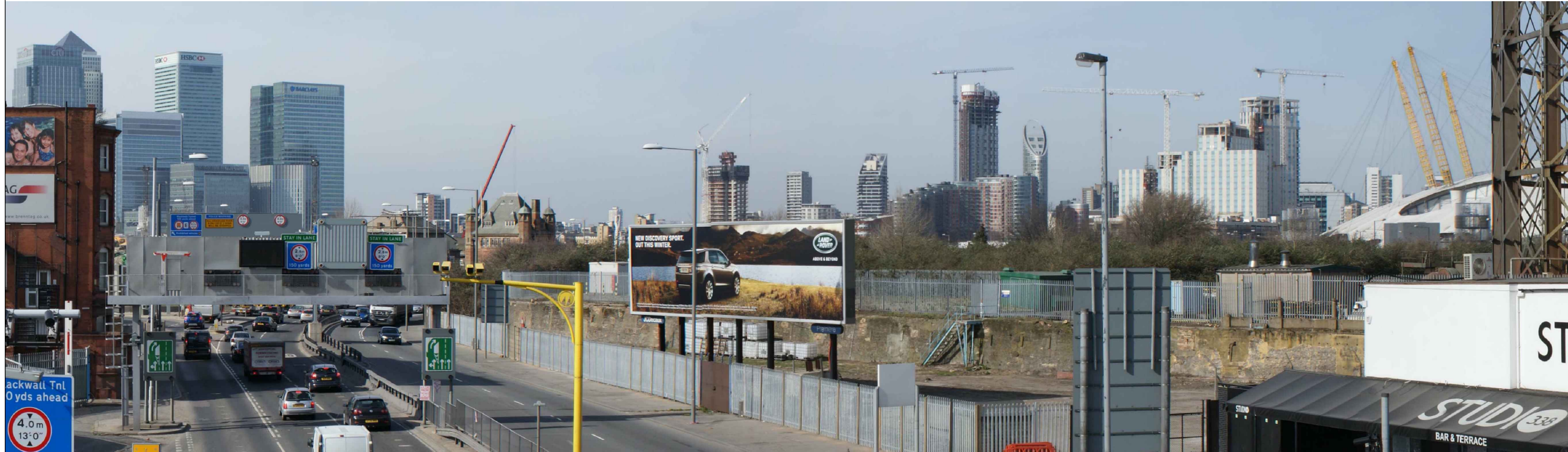
VIEWPOINT 3 - DAY TIME VIEW FROM PEDESTRIAN FOOTBRIDGE OVER A102 AT BOORD STREET, LOOKING NORTH WEST