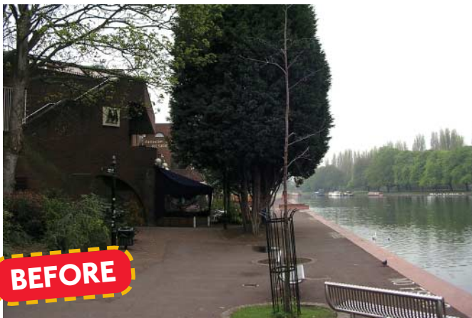
The new walkway complements the attractive surroundings.