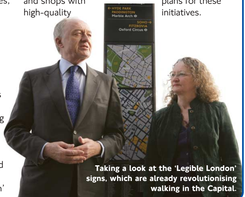
Taking a look at the ‘Legible London’ signs, which are already revolutionising walking in the Capital.

The new programmes are in addition to existing commitments, and TfL will be consulting with the London boroughs and walking, cycling and health stakeholders to develop the detailed plans for these initiatives.