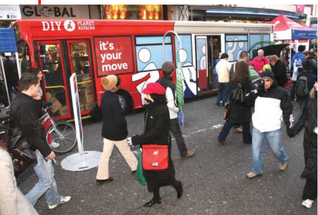
Above: the i-move London roadshow.

If your borough is organising an event and you want to attract people to walking or cycling, why not book one of TfL's roadshow trailers?