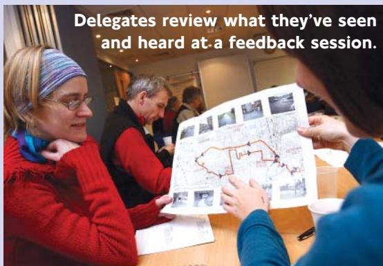
Delegates review what they've seen and heard at a feedback session.