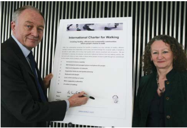
Mayor of London Ken Livingstone took the opportunity to sign the International Charter for Walking at the launch.