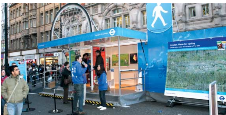
Right: the TfL Walking and Cycling trailer.

i To book either of these facilities or to find out more, please email imovelondon@rpmlimited.com or call 020 7926 9178