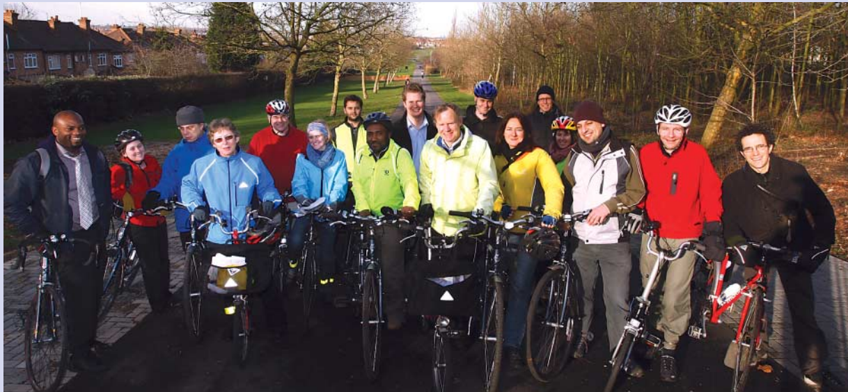
Borough representatives try out a new cycle path on a benchmarking visit to Haringey.