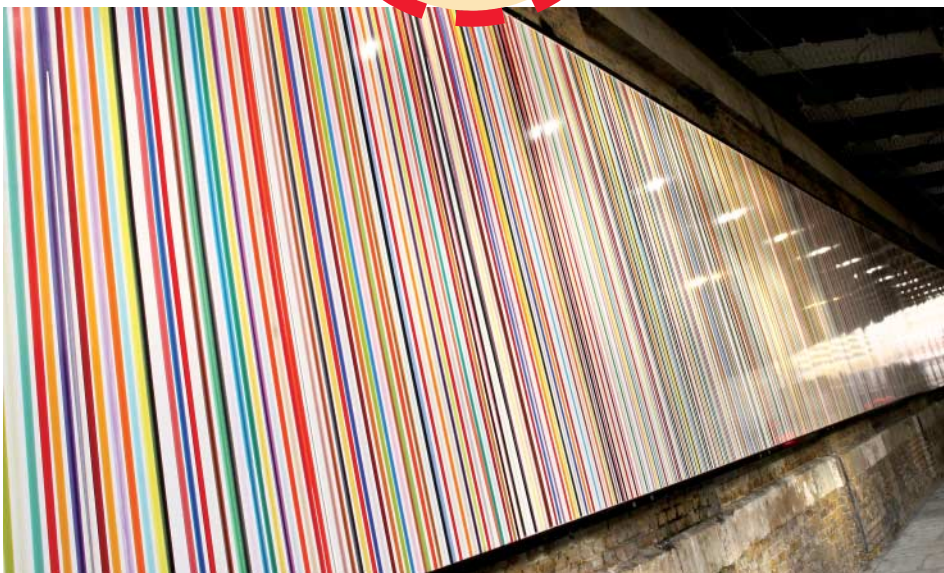
Poured Lines brightens up a bridge on Southwark Street.

"The project also includes regenerating railway arches to bring new business into the borough. We're opening up 10km of disused viaducts running parallel to the River Thames, which previously acted as a north-south divide for pedestrians."