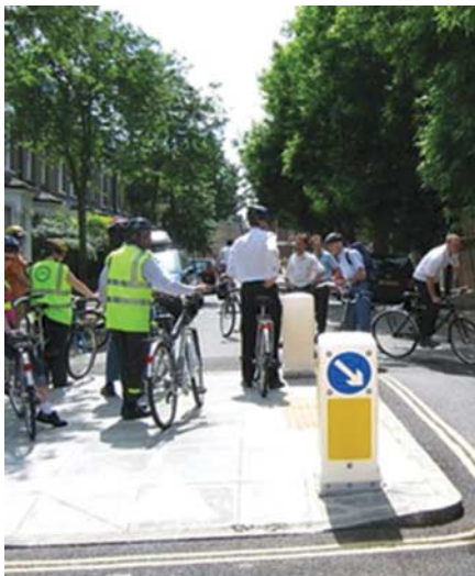
Out and about on a visit to Islington.

“And Southwark had carried out an interesting trial providing pool bikes for businesses. They seemed to do well to foster partnerships that enabled them to tap into less usual funding sources.”