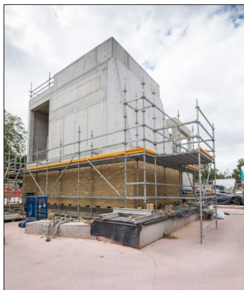
Fig.1. The brickwork around the head house

Works continue at pace below ground with the installation of mechanical and electrical (M&E) equipment such as lights, fans, fire alarms all progressing well. Doors to the various different plant rooms are being installed and the large fans that will ventilate the tunnels have been lifted into position. See fig.2 below.