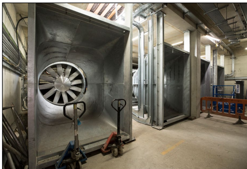
Fig.2 Installation of ventilation fans at the NLE Kennington Park site