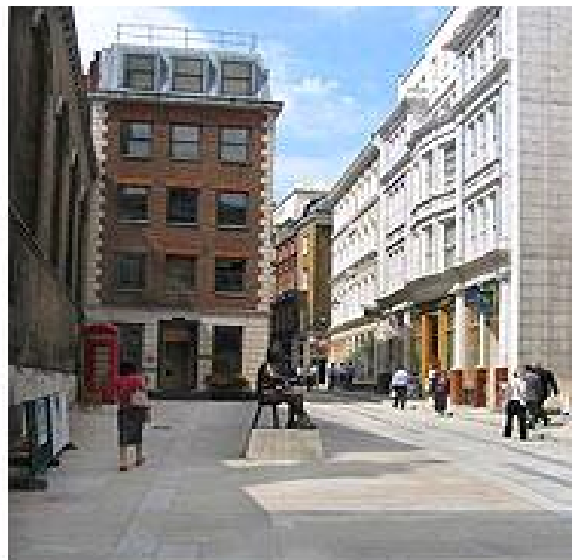
Figure 19 – Watling Street

Watling Street is closed to traffic from 8.00am to 6.00pm Mondays to Fridays between Queen Street and just east of Watling Court freeing this area for pedestrians during these times. The landscaping between Queen Street and Bread Street included repaved the carriageway with granite setts and the footways with York stone paving. The Cordwainer Statue has been re-sited in front of St Mary Aldermary Church, the planter replaced and there is improved seating. The New Change end of Watling Street was also being repaved with granite setts in the carriageway and York stone paving in the footway. (From www.corpoflondon.gov.uk ).