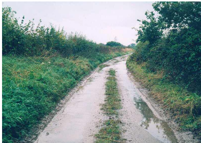
Figure 27 - Quiet Lane in Norfolk

Two schemes were included in the pilot project, one in Norfolk and the other in Kent. Attitude surveys were undertaken both before and after the implementation of the schemes. Support for the schemes was strong in both the before and after surveys with at least 75% of respondents in favour. However a large proportion, one third in Norfolk and one half in Kent did not believe the scheme was working in practice (Kennedy et al , 2004a; Kennedy et al , 2004b). Although flows reduced, there was little change in speeds.