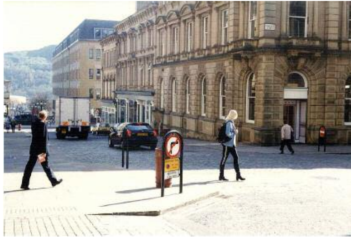
Figures 20 - Halifax Historic Core Zone

reducing the number of traffic signs and fixing those remaining on to walls where possible or on 1m high tubular hoops - see Figure 20.