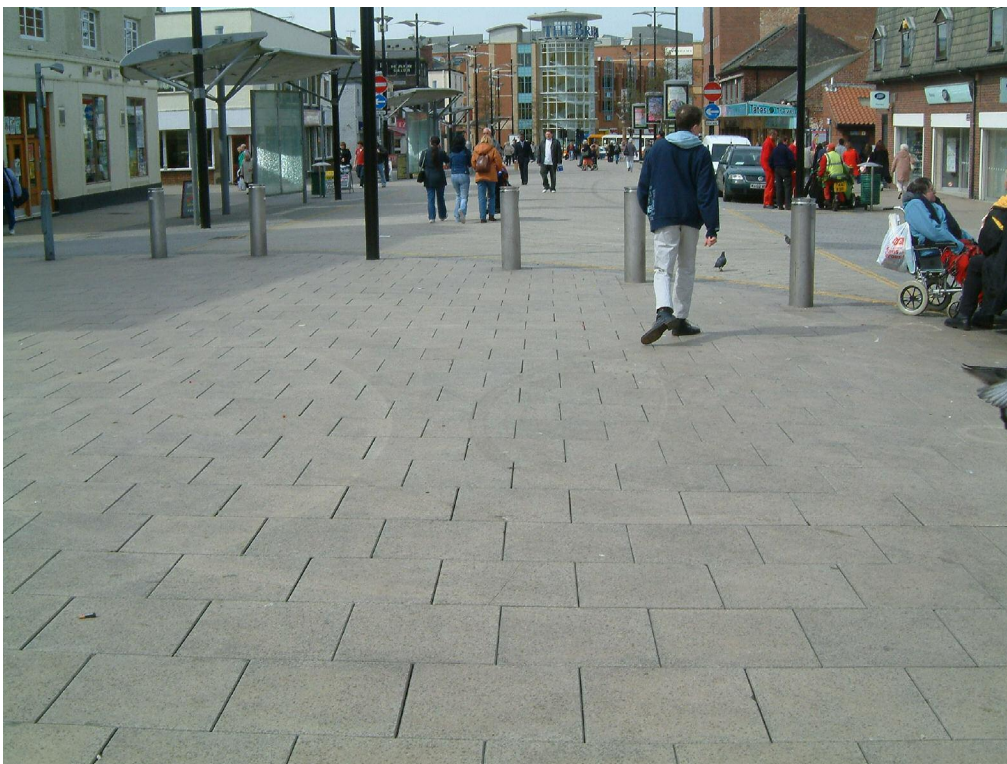
Figure 2 – A more ‘user friendly’ streetscape

However, there does not currently appear to be a readily available body of published research literature on the impact of such schemes, nor is there a clear understanding of why such schemes, which go against historical urban design principles, might work or not work. Where information has