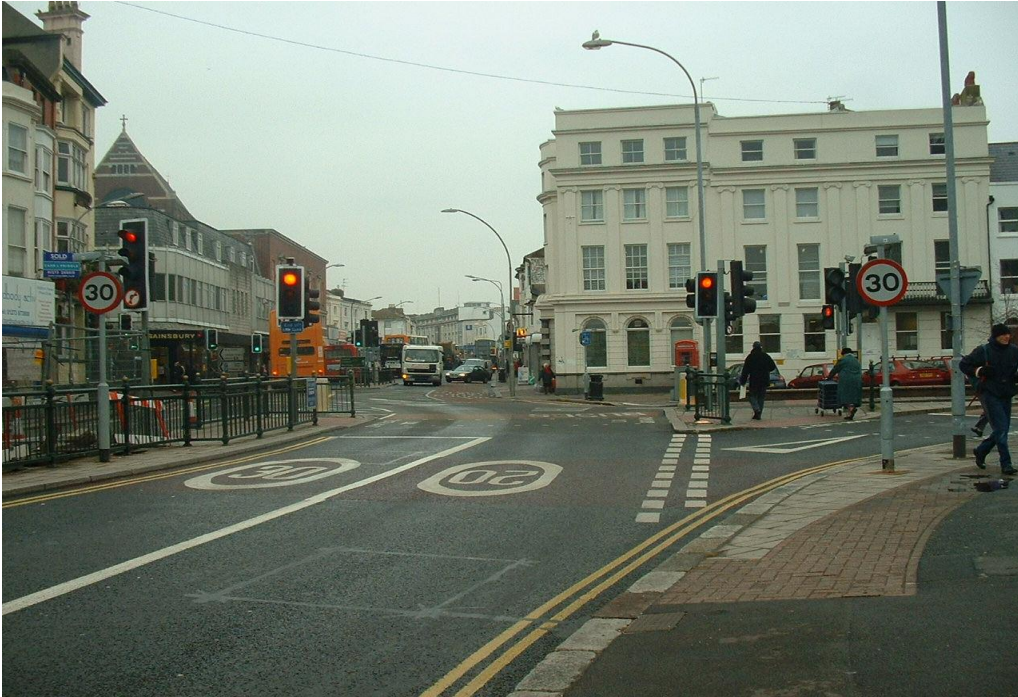
Figure 1 – A ‘cluttered’ streetscape