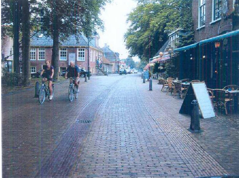
Figure 10 – Olderberkoop

In Olderberkoop the whole village was redesigned and the speed limit was reduced from 50 km/h to 30 km/h. In the 6 years before the scheme there were 3 injury collisions and 14 damage only collisions. In the 2 years following the scheme, there were no injury collisions recorded and 5 damage only collisions.