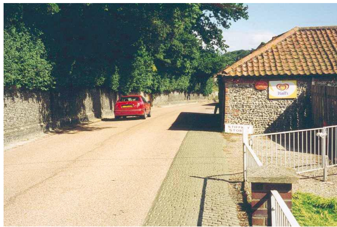
Figure 28 - Overrunnable footway in Stiffkey in Norfolk

On the approaches to Stiffkey, gateways were introduced comprising new signs and sandy coloured patches on the road surface. In the village centre a 20mph speed limit was introduced and supported by a sandy coloured road surface without white lines to impart a country-lane 'feel'. A short length of imprinted surfacing with a 6mm upstand was added outside a shop (Figure 28). This surface is used variously by large vehicles (as an over-run area), by pedestrians, for parking and as a cycle lane. Changes in Occold and Blakeney were minor, but included a signs audit.