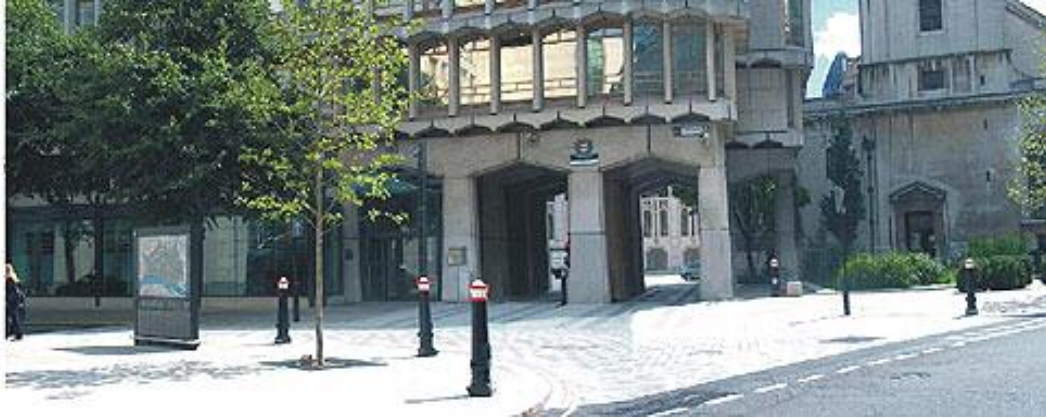
Figure 15 – Aldermanbury

The Street Scene enhancements and landscaping in Aldermanbury have been undertaken in connection with the construction of the new Guildhall entrance. Most of the site is within the Guildhall Conservation Area and St Lawrence Jewry Church, which is to the east of the pond, is a Grade 1 Listed Building.