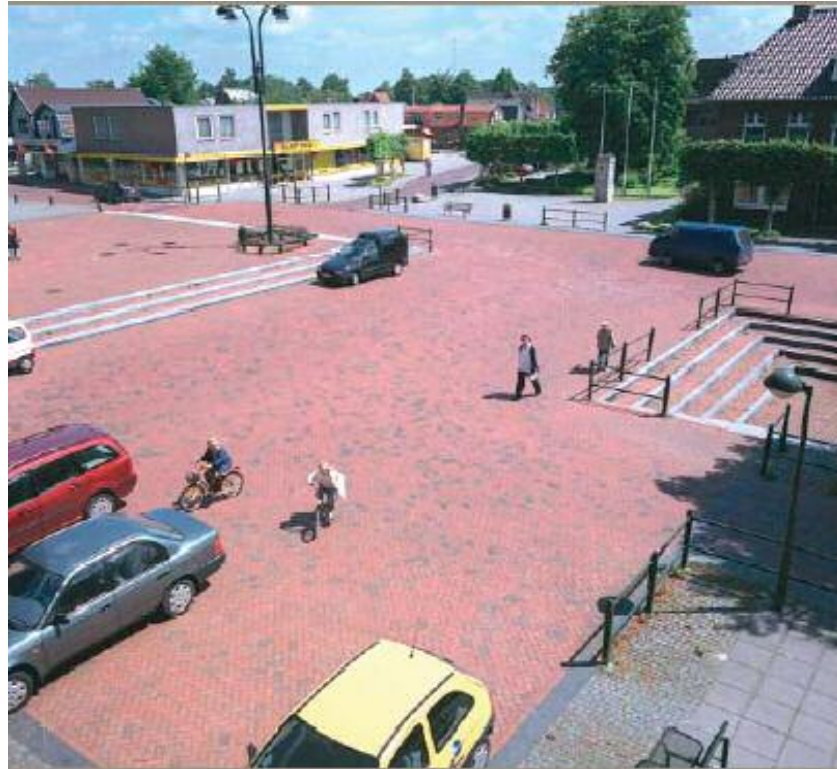
Figure 4 - Oosterwolde (de Brink junction/Rode Plein), aerial view