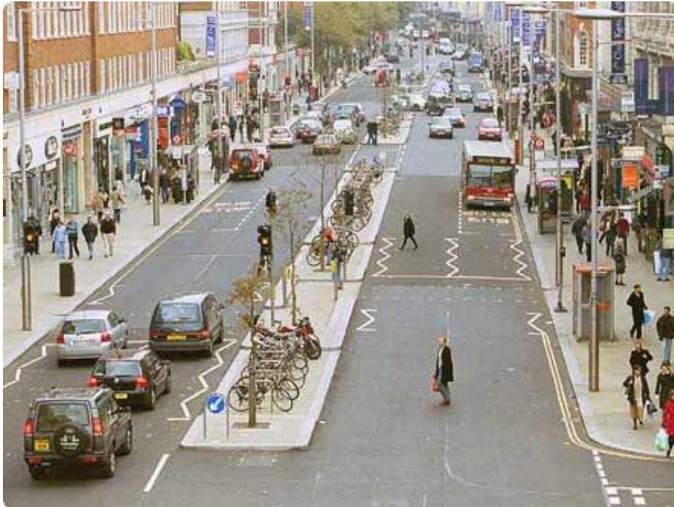
Figure 13 - Kensington High Street – after changes

A review of collisions in the before and after periods has recently been made available. The 'before' period was for 3 years prior to the implementation of the scheme. The 'after' period so far available is only for 28 months, instead of the 'matched' 36 planned; therefore the figures in the following table must be taken as being only provisional. The figures show the collision rates for the scheme itself as well as for the whole region - which can be used as a 'control' to allow for other changes resulting from the introduction of the Congestion Charge.