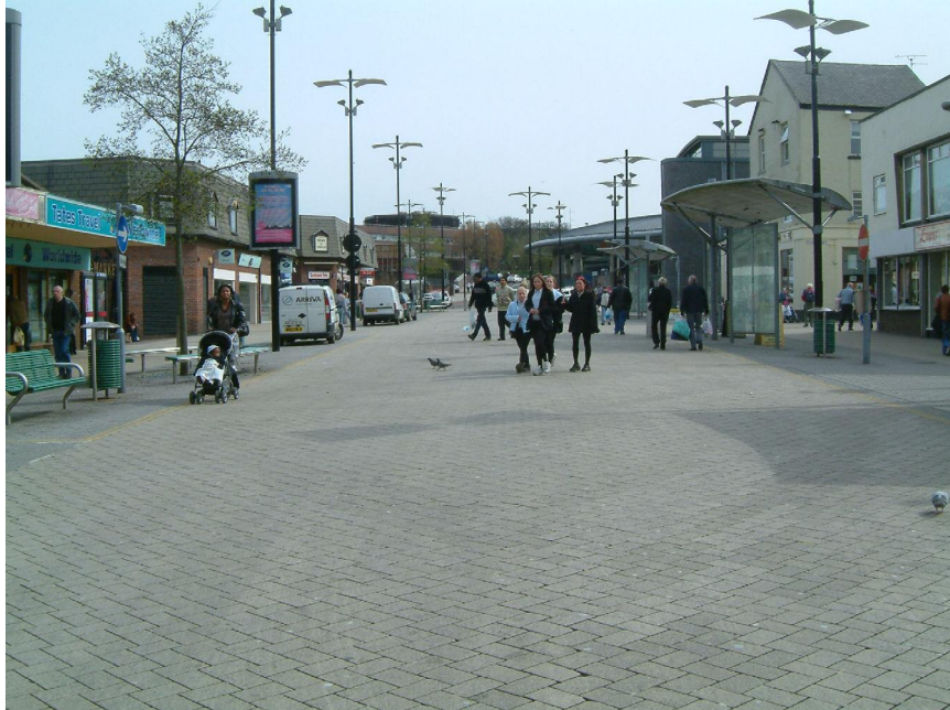
Figure 24 – Park Lane, Sunderland

The Park Lane scheme – see Figure 24 -was undertaken to support the development of a new public transport interchange in Sunderland. Park Lane forms a link from the interchange to the main shopping area of the city.