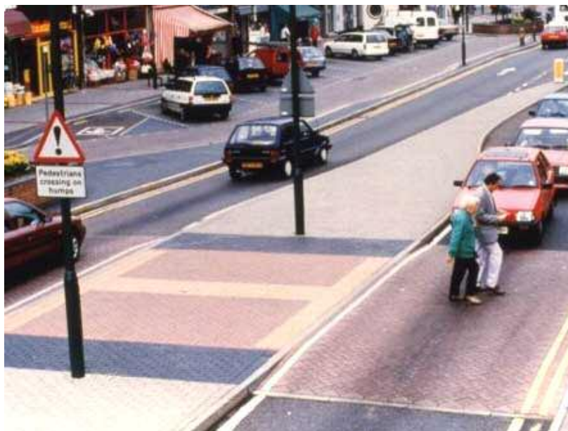
Figure 23 – Borehamwood

In 1989 an experimental scheme was proposed for a limited section of Shenley Road to tackle the traffic problems and improve the local environment. The success of this scheme, and its acceptance by the public, led to it being extended along the entire road (see Figure 23).