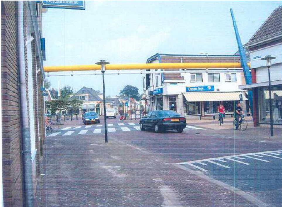
Figure 11 – Wolvega

In Wolvega, traffic signals were removed from a busy cross road junction. No fatal collisions have ever been recorded at this junction, although there had been 1 injury collision in both the 4 year before and after period. There were 4 damage only collisions in the 4 year before period only two in the after period. Unusually no damage only collisions were recorded either in the year that the junction was reconstructed or in the following year.