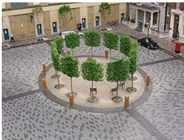
Figure 16 – Devonshire Square

Devonshire Square has been re-landscaped to create a more usable and attractive public space as part of the Street Scene Challenge.