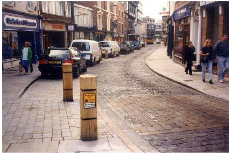
Figures 21 - Shrewsbury Historic Core Zone

thought it had benefited pedestrians crossing the road and 75% thought it had adversely affected cyclists.