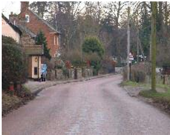
Figure 26 – Removal of white lines in Starston in Norfolk

Although white lines have been used for the past 90 years on roads in the United Kingdom, very little research appears to have been conducted into their effect. However, recent studies showed that under certain conditions, for example, where there is a 30mph speed limit, their removal can reduce free flow driving speeds. An example is the village of Starston in Norfolk, where unpublished research shows speeds were reduced by 7mph as a result of removing central white lines (Figure 26). A similar study in Wiltshire (Debell, 2003) showed that there are safety advantages to be gained by removing centre lines in 30mph zones in some circumstances, as the removal resulted in a 35% reduction in collisions and a 5% reduction in speeds.