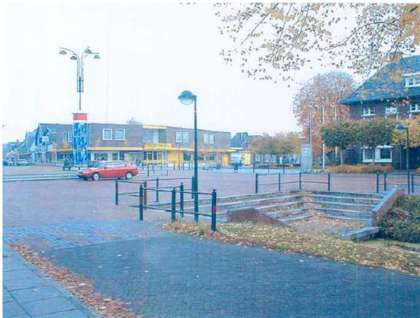
Figure 3 - Oosterwolde (de Brink junction/Rode Plein), street level view

This scheme also extended away from the junction along a shopping street. Signs and normal road markings were again removed and coloured and textured surfaces used to segregate vehicles and pedestrians, the appearance being enhanced by a patterned design built into the road surface. The footway was almost level with the road, marked with a different textured surface and separated by bollards from the road, lighting and trees. It is documented that here casualties had fallen by 10% in the three years since the scheme was introduced.