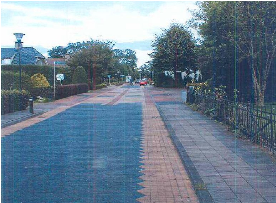
Figure 9 – Donkerbroek

The Donkerbroek scheme used different colours and textures to highlight a junction. Injury collisions were reduced from 1 in 5 years to none in 3 years, while damage only collisions increased from 11 in 5 years to 9 in 3 years, with 6 damage only collisions being recorded in the year the scheme was introduced.