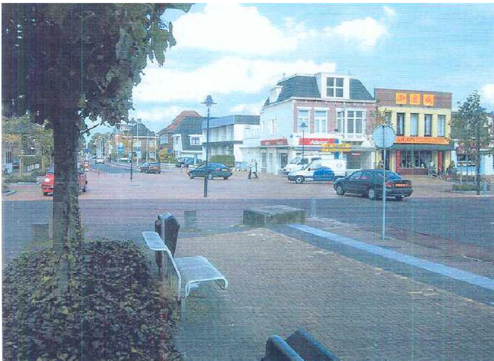
Figure 6 - Drachten (Kaden-Torenstraat)

Although this was a relatively busy junction, at least compared to Oosterwolde, with vehicle flows of around 17,000 per day and pedestrian and cycle flows of around 2,000 per day – the scheme appeared (at least in the short term) to reduce collisions. In the seven years before the scheme was introduced (in 1999) 30 collisions had been reported including 4 involving injury. In the two years following the scheme only 4 collisions (all damage only) were recorded.