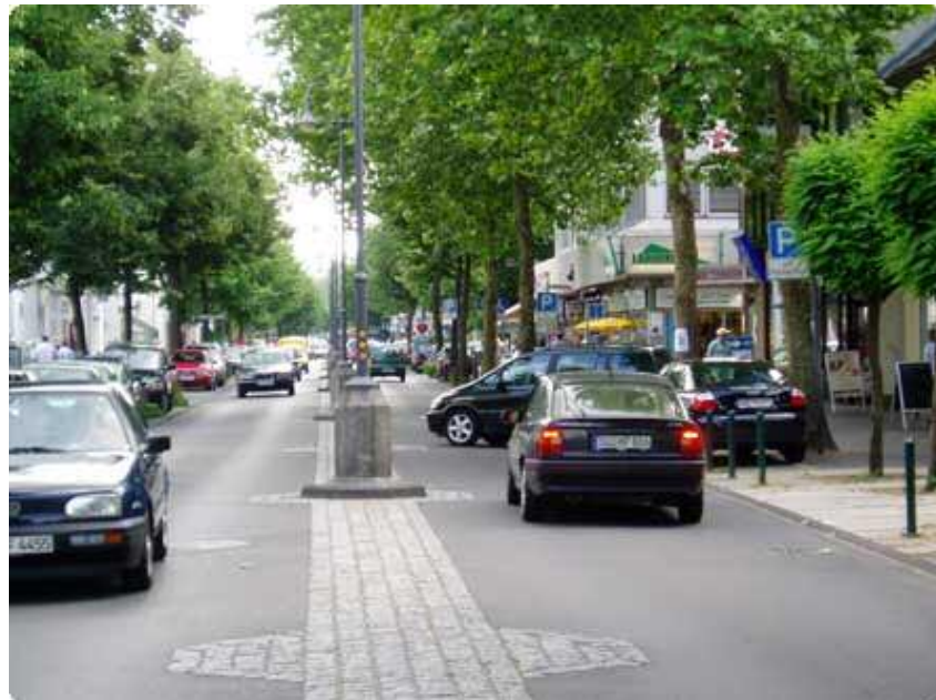
Figure 12 – Frankfurter Strasse

Although the scheme was deemed a success in that it reversed the economic decline of the businesses in the road, it did not prove possible to obtain any collision statistics on the scheme, although it was reported that traffic speed were reduced.