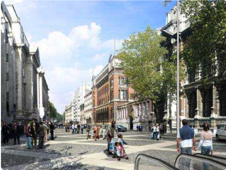
Figure 14 – Artists impression of Exhibition Road

The Exhibition Road area of South Kensington is home to an interesting mix of residents and an extraordinary cluster of world class museums and institutions. These institutions attract over nine million visitors a year, making the area one of the most important cultural destinations in London (From www.rbkc.gov.uk/EnvironmentalServices/general/ex_roadintro.asp , 27/06/05).