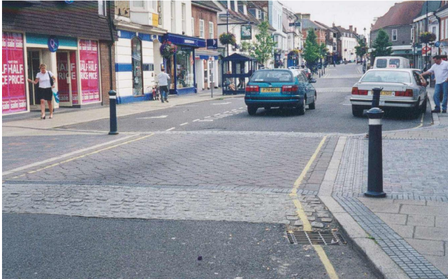
Figure 29 - Alton (High Street), Hampshire

Although the interactions of drivers and pedestrians at these informal crossings is not well understood, they may give some indications of how road users in less regulated areas might behave with respect to taking or ceding priorities. Early unpublished studies conducted by TRL at three sites (Crawley, Shrewsbury and the London Borough of Hillingdon) featuring flat-top humps or crossing places laid in contrasting surfacing found there was a correlation between pedestrian crossing flow and the proportion of drivers giving way. A more recent, again unpublished, comprehensive study, using video observation and public surveys, examined give way behaviours at over 30 crossing places in 18 schemes concentrated on crossing places utilising flat-top humps the majority of which were located in town centre shopping streets, with the remainder in or close to neighbourhood shopping areas. They included one or more features at the hump to suggest that this was an appropriate place to cross the road e.g. carriageway narrowing, tactile paving, bollards, guardrails and/or a continuation of footway paving material across the hump.