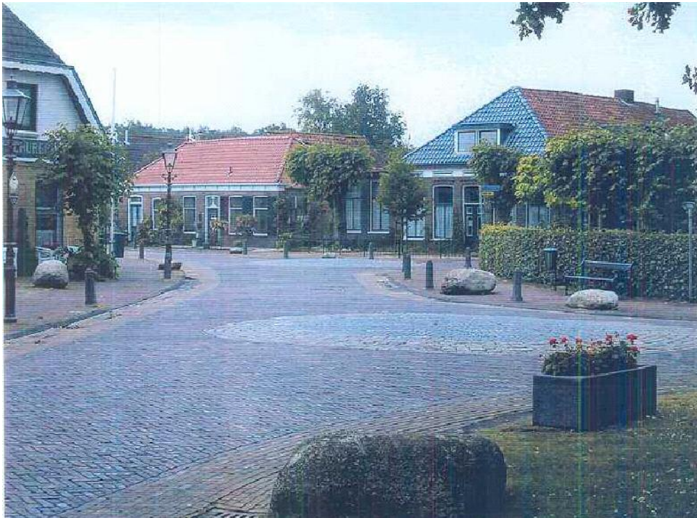
Figure 5 - Oosterwolde (Makkinga)

Collision data was available from 1993 to 2001 so that discounting the year the scheme was introduced meant that there was both a 4 year before and after period. While no fatal collisions were recorded at any time, there were 2 injury collisions in the 4 years after the scheme compared to none before, while there were 2 damage only collisions in the four years before the scheme compared to 3 after the scheme had been introduced. 3 damage only collisions were reported in 1997, the year the scheme was constructed.