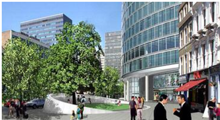
Figure 17 – Moor House Street

The scheme included closing a small section of Moorfields to vehicular traffic, re-landscaping the area that is currently a traffic island, introducing more tree planting and seating, and upgrading all paved surfaces south of Moor Place (From www.corpoflondon.gov.uk ).