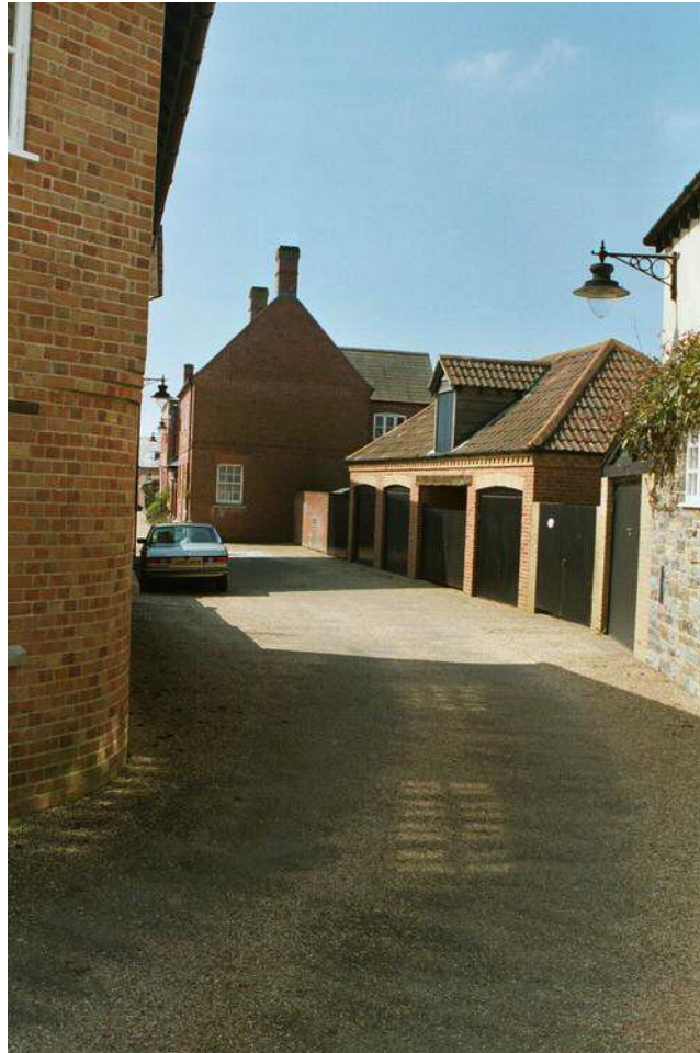
Figure 25 – Typical street in Poundbury

The highway layout was designed to reflect a traditional Dorchester village rather than comply with modern design standards and comprised of a series of courtyards with interconnecting through routes. Corner radii and visibility splays are significantly reduced.