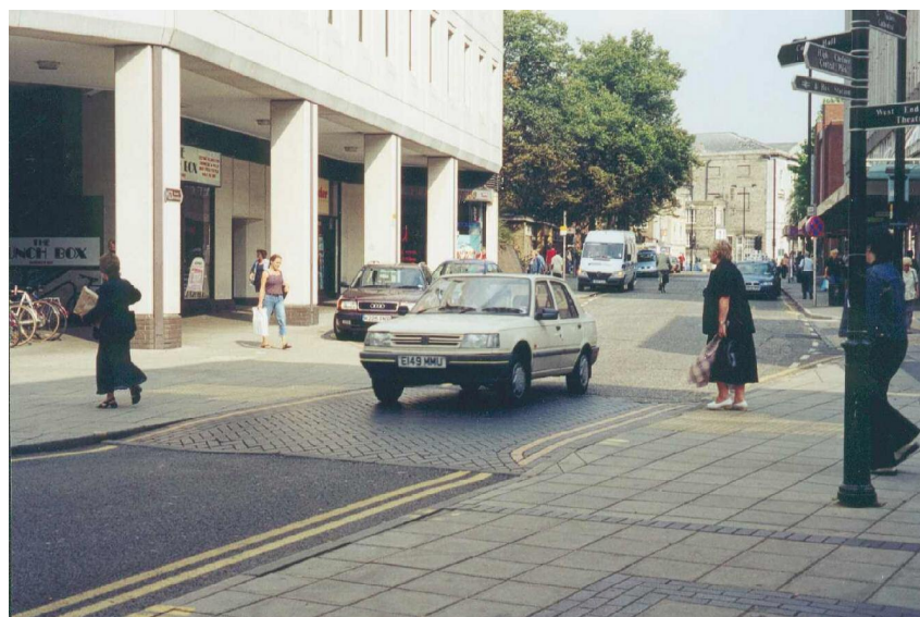
Figure 30 - Chelmsford (Market Road), Essex

Although the interactions of drivers and pedestrians at these informal crossings is not well understood, they may give some indications of how road users in less regulated areas might behave with respect to taking or ceding priorities. Early unpublished studies conducted by TRL at three sites (Crawley, Shrewsbury and the London Borough of Hillingdon) featuring flat-top humps or crossing places laid in contrasting surfacing found there was a correlation between pedestrian crossing flow and the proportion of drivers giving way. A more recent, again unpublished, comprehensive study, using video observation and public surveys, examined give way behaviours at over 30 crossing places in 18 schemes concentrated on crossing places utilising flat-top humps the majority of which were located in town centre shopping streets, with the remainder in or close to neighbourhood shopping areas. They included one or more features at the hump to suggest that this was an appropriate place to cross the road e.g. carriageway narrowing, tactile paving, bollards, guardrails and/or a continuation of footway paving material across the hump.