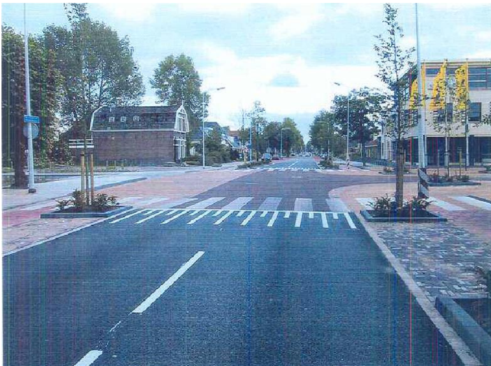
Figure 7 - Drachten (Kaden-Dwassva)

This scheme (which carried approximately the same traffic flows as Kaden-Torenstraat) did not appear to show the same safety benefits. Collision data was monitored from 1993 until 2001 with the scheme being constructed in 2000. In the 7 years before the scheme there were 3 injury collisions and 17 damage only collisions. In the single year following the scheme (2001) there were 7 collisions including one injury collision. To address this continuing collision problem it is planned to reduce the speed limit at the site from 50 km/h down to 30 km/h.