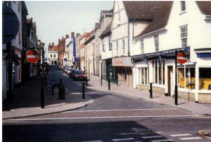
Figures 22 - Bury St. Edmunds Historic Core Zone

The historic core zone scheme was intended to address a number of problems including through traffic, pedestrian/vehicle conflicts, on-street parking, servicing and visual intrusion of traffic signs (Wheeler 1999b). The scheme involved defining a threshold entrance to the zone, introducing a 20mph speed limit, rationalising road signs and providing more space for pedestrians - see Figure 22. The scheme was introduced in two phases, the first in Hatter Street and Whiting Street, and the second in Crown Street and Chequer Square.