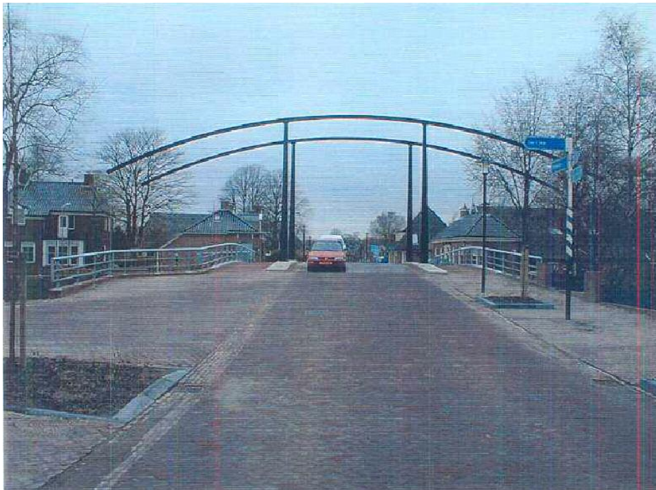
Figure 8 – Opeinde

This scheme involved a larger area than many typical junction schemes. The entry points of the town (or at least that part of the town involving the scheme) were clearly marked with a large ‘gateway’ or tubular steel arch (see Figure 8). Inside the gateway the road layout is different from that typically encountered. There were no ‘normal’ road markings and kerbs and roads are surfaced differently to denote a change from a world where traffic had priority to a public space where appropriate social behaviour is expected. Road widths were reduced from 9 metres to 6 metres and kerbs removed – and although pedestrian, cyclist and vehicle space was indicated it was not physically segregated in the typical way.