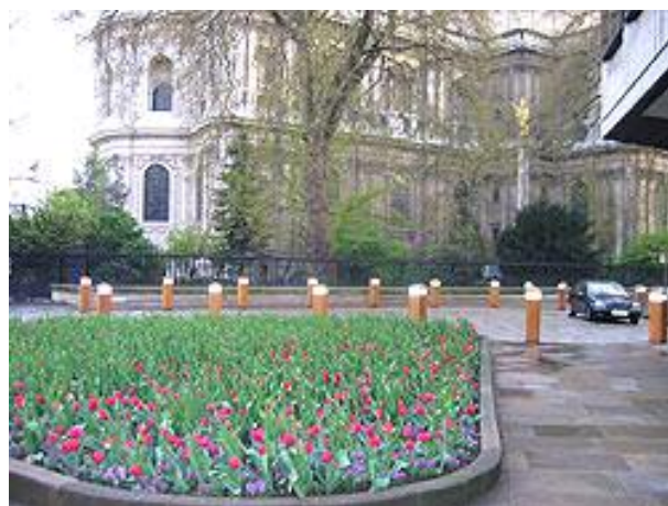
Figure 18 – Paternoster Row

The Paternoster Row Street Scene project centres on the reconfiguration of the carriageway at Paternoster Row that no longer functions as an access road to the Paternoster development. The carriageway has been reshaped to create a rounded turning head, this is installed at the existing footway level, and surfaced in large 300mm x 150mm granite setts.