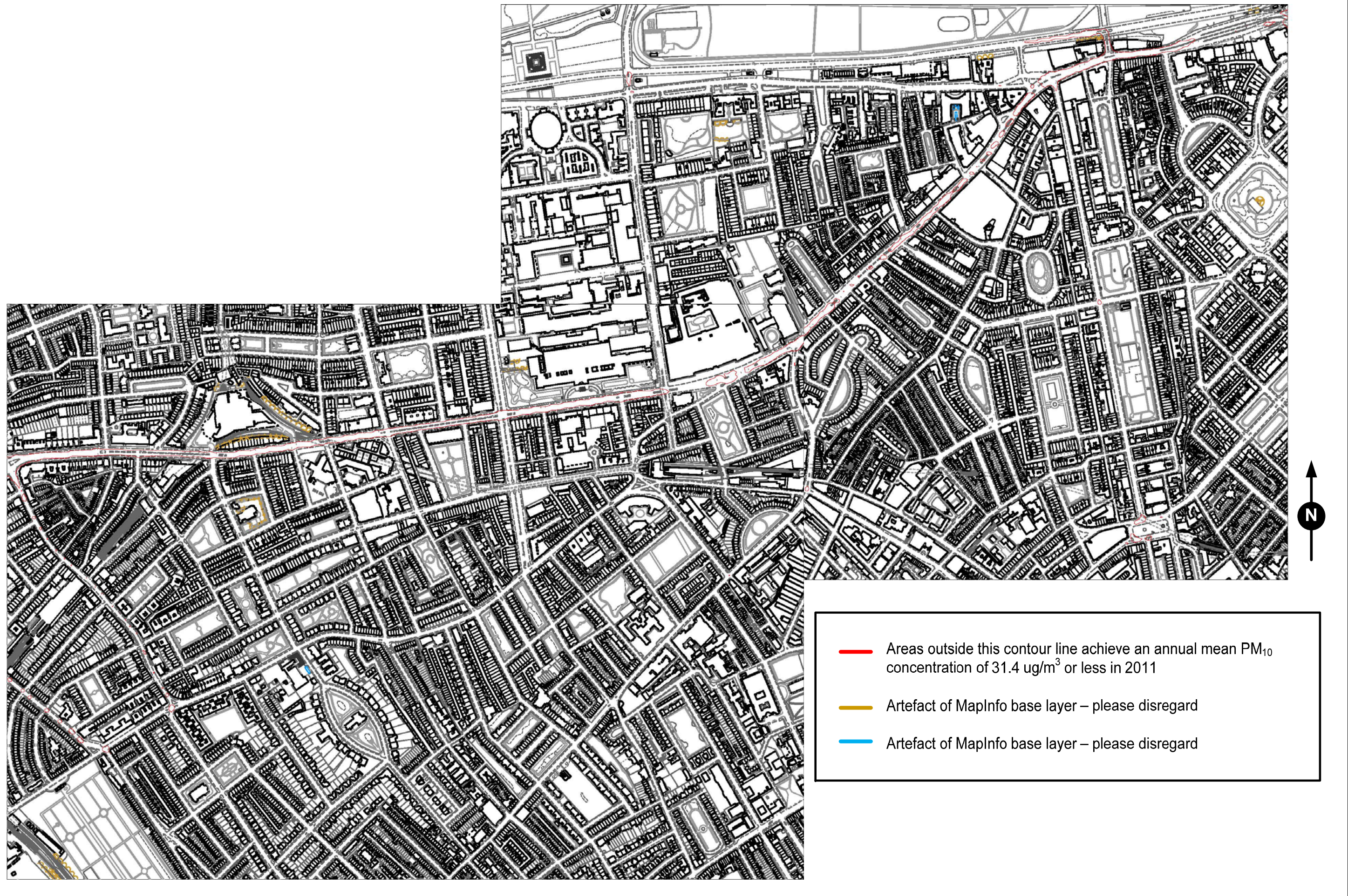
Figure 6-2: Annual mean PM 10 concentrations along Cromwell Road, 2011, WEZ removed