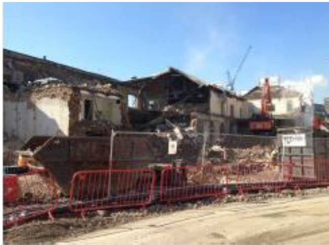
2) Banhams Demolition works