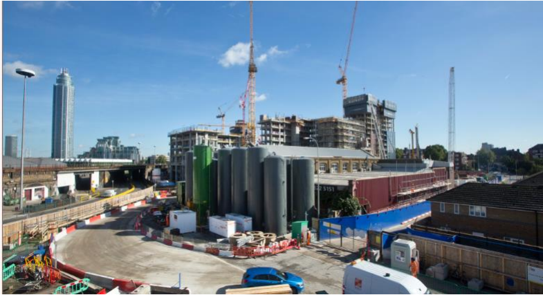
1) Bentonite Plant