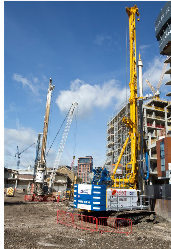
3) Piling activities