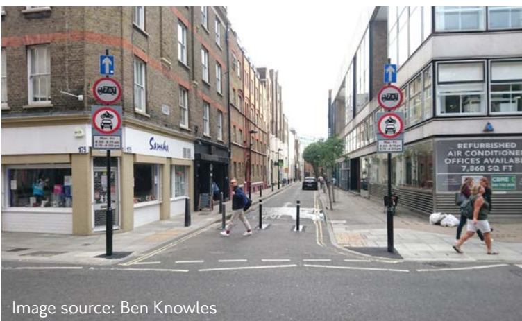
Blackhorse Road, LB Waltham Forest

Closing streets around schools to traffic at the start and end of the school day helps promote walking and cycling and reduce short car trips, and provides a safe space for children and parents.