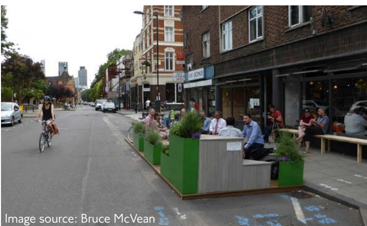
Chatsworth Road, LB Hackney

Space for parking can be converted to provide temporary or seasonal seating.