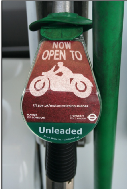
Awareness campaign petrol station door poster