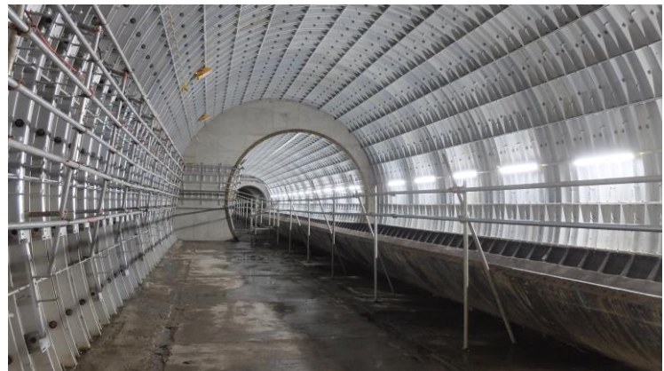
Above – old Northern line tunnel and with rings removed.

Works will be monitored at all the times using the best practicable means of work.