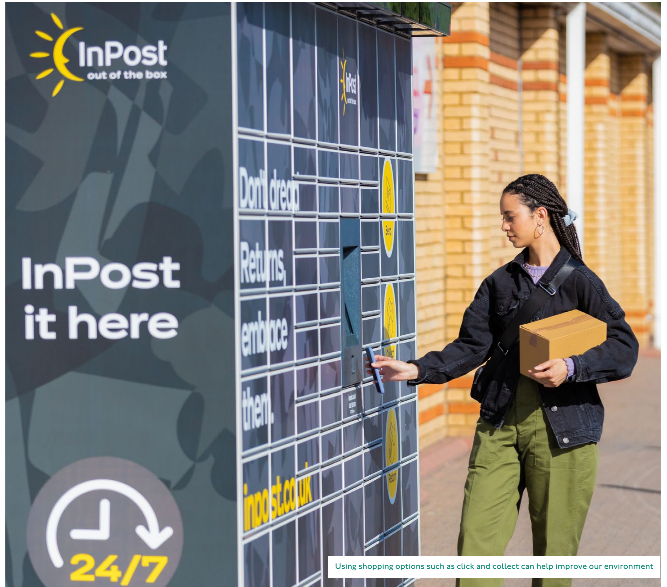
Using shopping options such as click and collect can help improve our environment