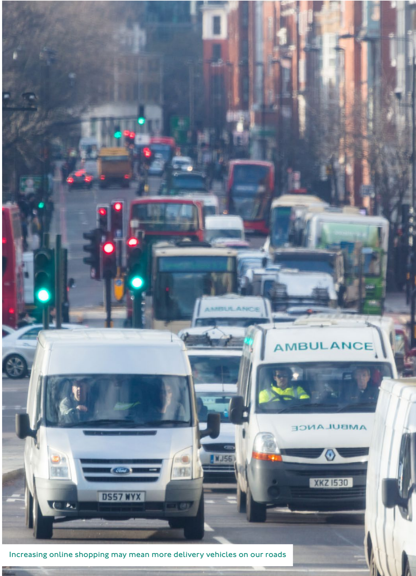
Increasing online shopping may mean more delivery vehicles on our roads