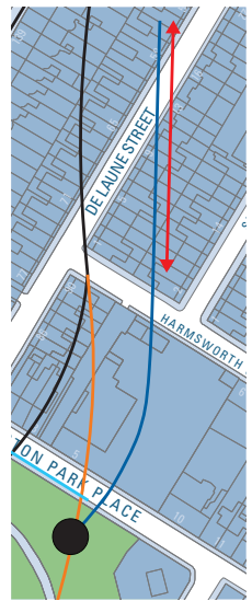
Location of proposed gallery tunnels