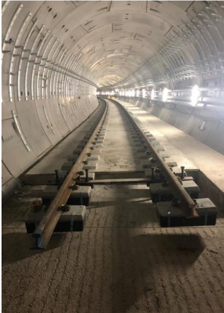
Fig. 3 Track Installation from the NLE Nine Elms site to the Kennington site

application of 'screed', a layer of concrete added to the structural slabs to achieve the final architectural finish at each level plus MEP (mechanical, electrical and plumbing) fit out.