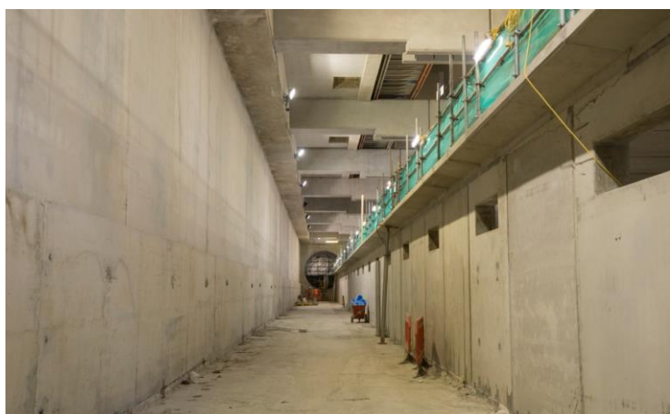
Fig.1 The platform at Nine Elms Station with the tunnel entrance in the distance complete

Since August, we have seen the site transform below ground as the majority of the structural activities are now complete at basement level 2 – 4. These include the construction of the columns, walls, headwalls (the surface area around the tunnel entrances) and the future station platform. Approximately 600 precast concrete elements (slabs and walls) have been placed in situ to form the future platform. Blockwork has commenced at basement level -2 to form the rooms and corridors of the station. (See Figures 1 and 2 below).