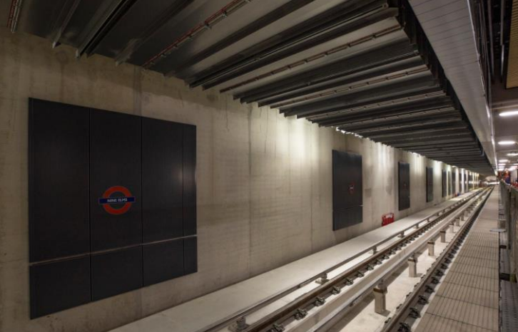
Fig. 3 Nine Elms Station