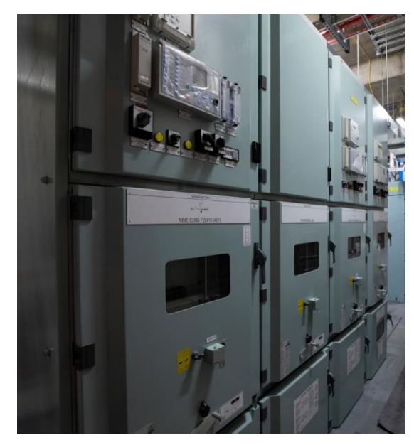
Fig. 2 Traction substation room

Power was officially switched on by UKPN in December following the electrical connection of the new transformers located in the station's distribution network operator room. This milestone will now enable the team to 'energise' other rooms and areas of the station where equipment is being used and allow for the future testing and commissioning phase to take place. Figure 2 shows the equipment that has been installed so far in the traction substation room. The temporary substations previously used are no longer required and will be removed in Spring.