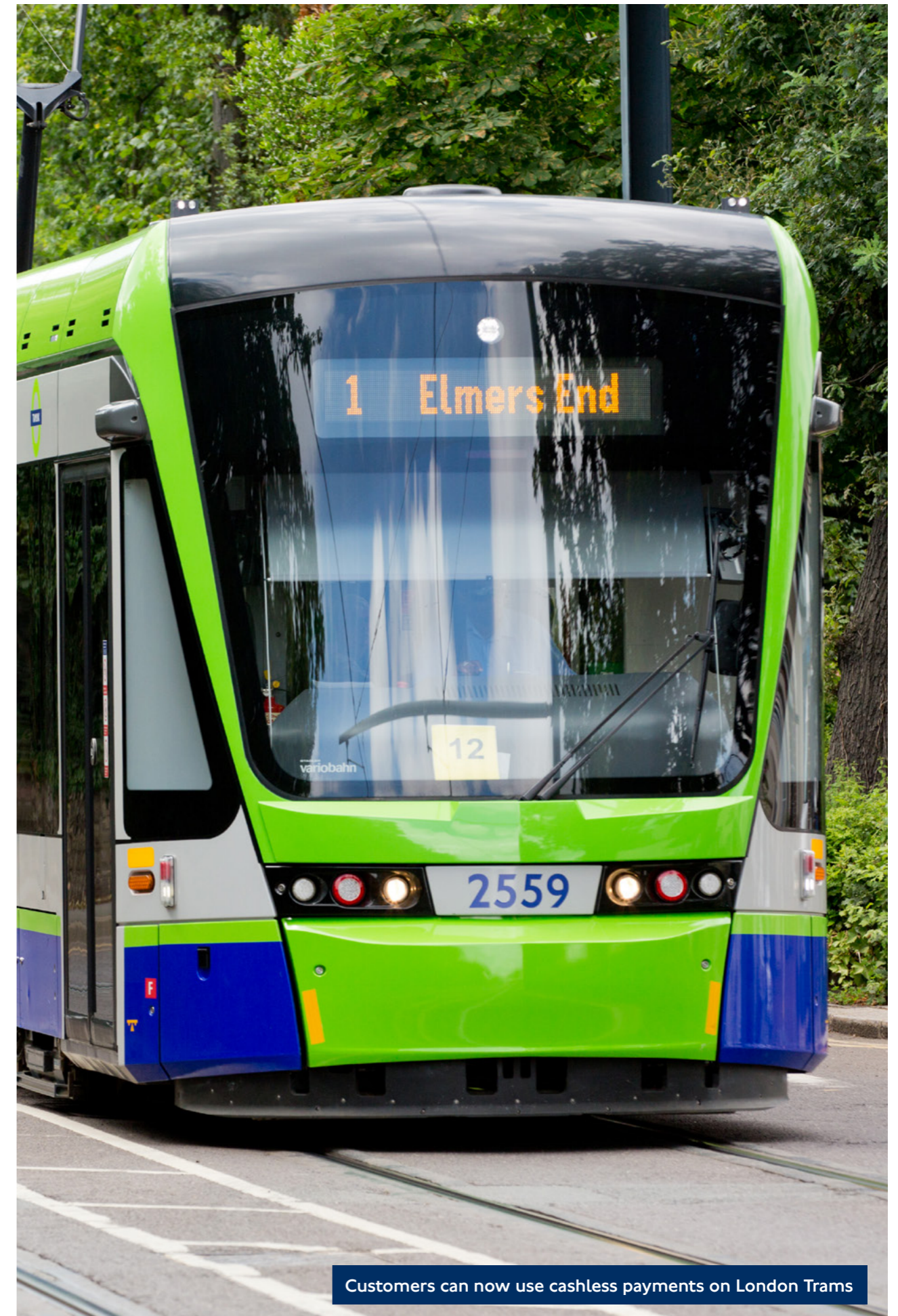
Customers can now use cashless payments on London Trams

We have begun the procurement of 90 ULEZ compliant vehicles for the Dial-a-Ride fleet, ahead of the introduction of the first stage of the ULEZ in April 2019. We are expecting to award the contract for the new vehicles later in summer 2018.