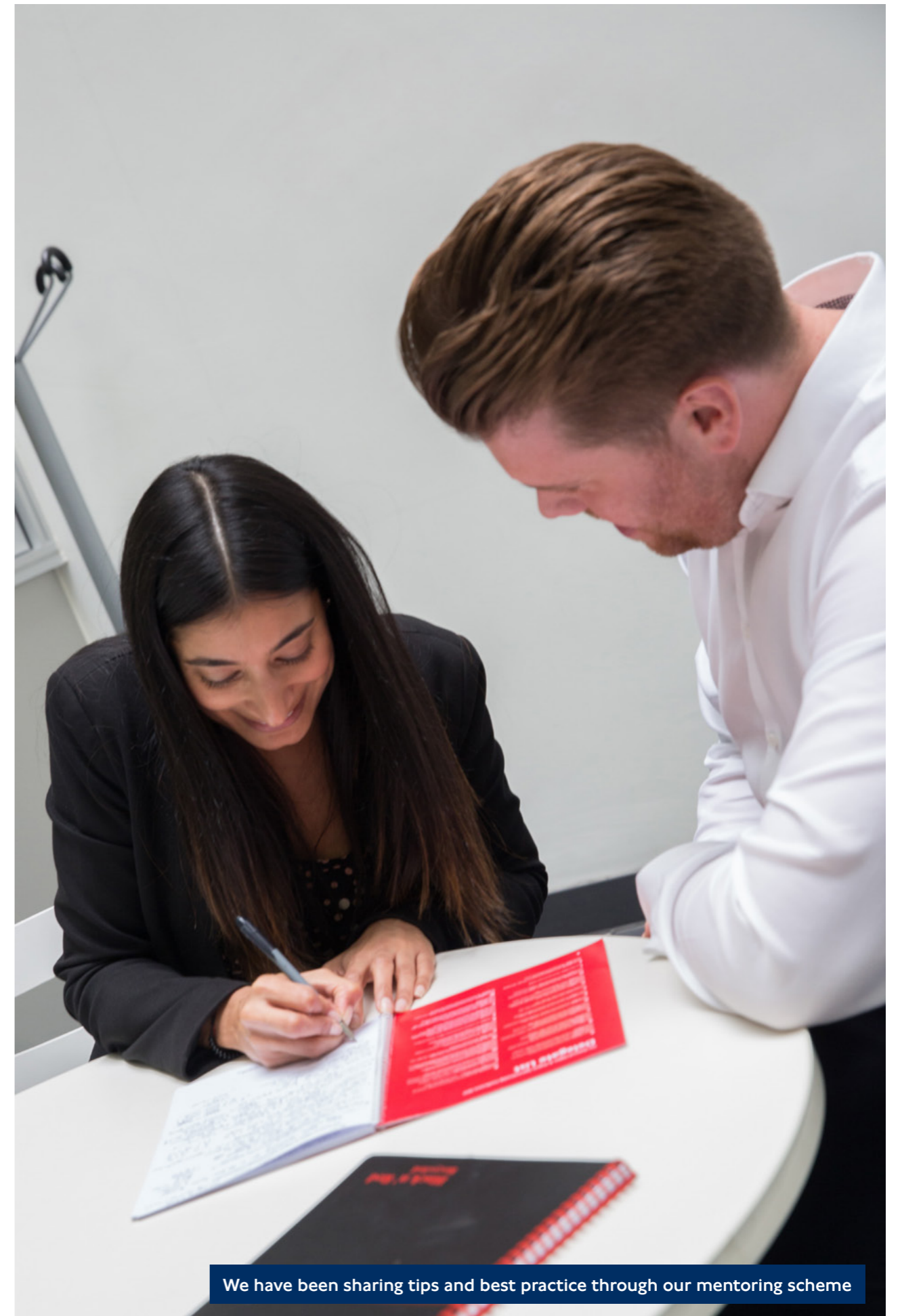
We have been sharing tips and best practice through our mentoring scheme

We are also placing a strong focus on internal mentoring during the coming performance year. Mentor Matching has recently been set up to link potential mentees to a suitable mentor. Our leaders have a wealth of knowledge and experience to share – and perhaps even more importantly, understand the landscape, politics and idiosyncrasies of the business better than anyone. For mentees, this is a chance to explore individual personal goals and get a different perspective on careers and development opportunities in the organisation.