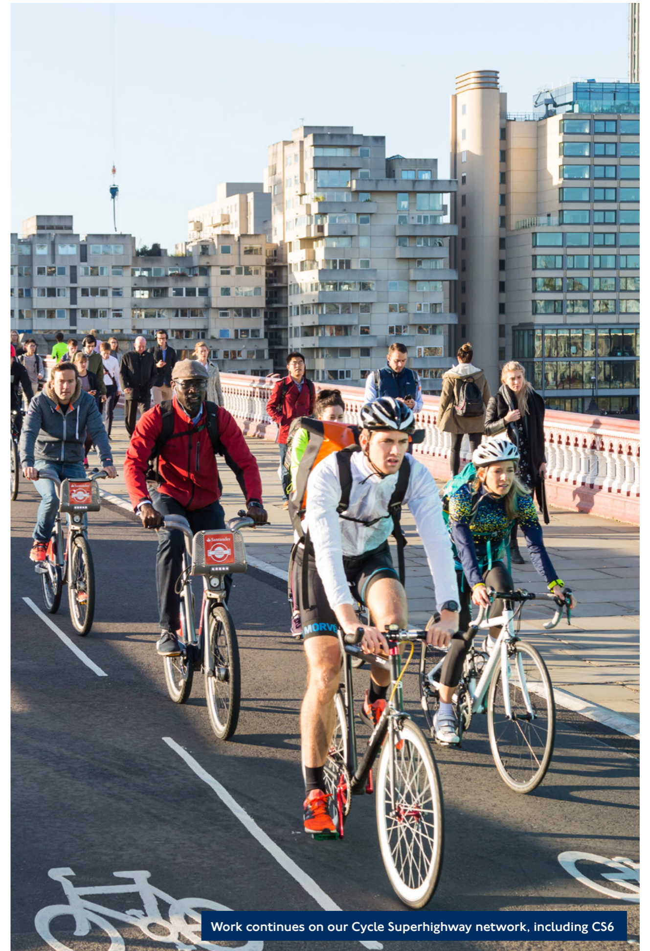
Work continues on our Cycle Superhighway network, including CS6

This summer we will begin work on site for Cycle Superhighway II (CSII), which will run between Swiss Cottage and the West End. The scheme is due to be finished by 2020. We have received an application for a judicial review of our decision to proceed with the construction of CSII, from Westminster City Council, which we are robustly defending.