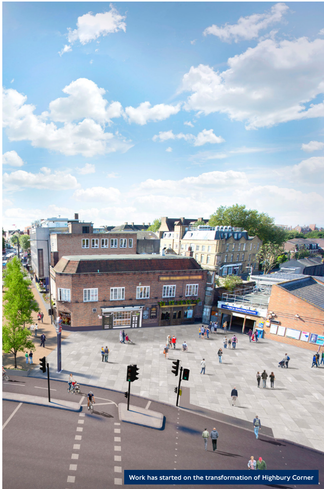
Work has started on the transformation of Highbury Corner

We have completed improvement schemes on the A202 Camberwell New Road and on Flodden Road, and introduced Cycle Advanced Stop Lines at Chelsea Embankment. We have also completed a consultation on removing roundabouts at Millbank, by Lambeth Bridge, with a design which replaces them with fully signal-controlled crossings, including pedestrian and cycle facilities. We continue to develop the detailed design for Charlie Brown's Roundabout in South Woodford, with construction planned for summer 2018.