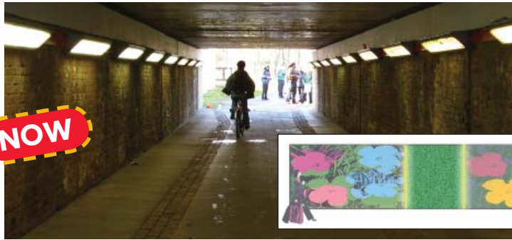
The underpass as it is now and one creative possibility for its future.