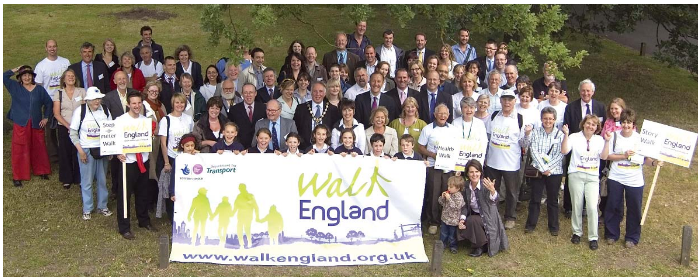
The launch of the website was a huge success.

Interactive website opens up networking opportunities for keen walkers