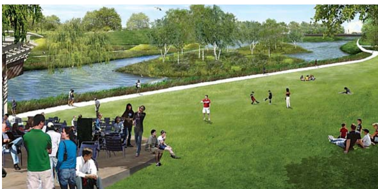
Above and right: Vision for the future – the Olympic Park after the Games.

i For more information on the plans, visit the LDA's legacy website www.legacy-now.co.uk