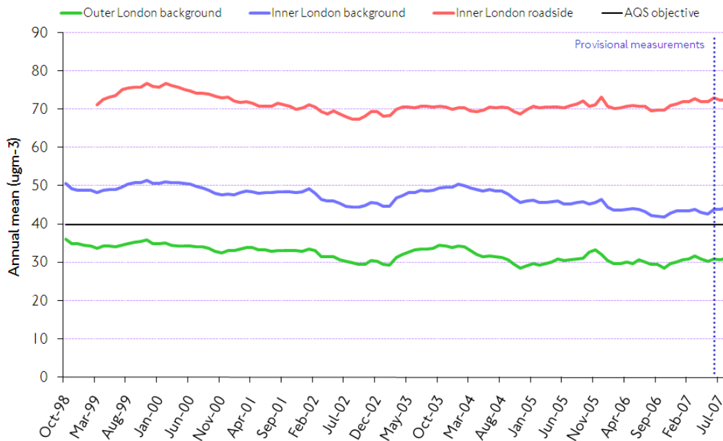
Figure 6.8 Running annual mean nitrogen dioxide (NO 2 ) levels, representative London air quality monitoring site groupings.

Figure 6.9 shows how concentrations of NO 2 vary across Greater London. On the basis of this indicative projection for 2004, reflecting meteorological conditions in 2003 (which gave rise to several notable pollution ‘episodes’, and which might be considered a ‘worst case’ meteorological scenario), areas in yellow and red exceeded the UK National Air Quality Strategy Objective. This affected much of central and Inner London, reflecting the road network, and the area around Heathrow airport.