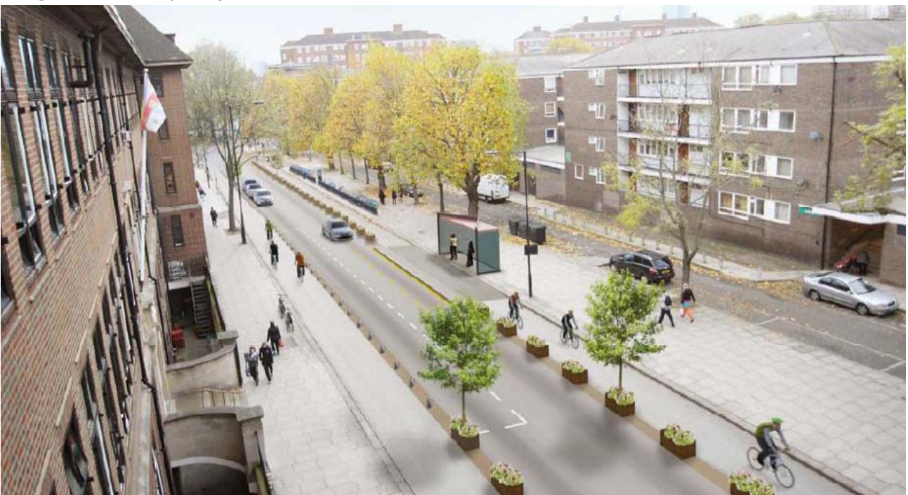
Visualisation of Royal College Street, Camden, an example of semi-segregation in London

Where there is conflict between modes (which there often isn't) we will try to make a clear choice, not an unsatisfactory compromise. We will segregate where possible, though elsewhere we will seek other ways to deliver safe and attractive cycle routes. Timid, half-hearted improvements are out – we will do things at least adequately, or not at all.