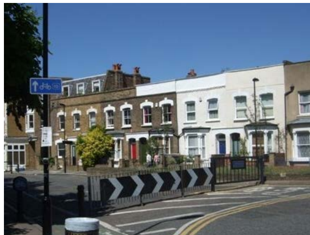
Staged improvements for cycling at Palatine Road, Hackney

The assessment also provides an argument for how improvements for cycling could be made in stages, trialling new layouts or different forms