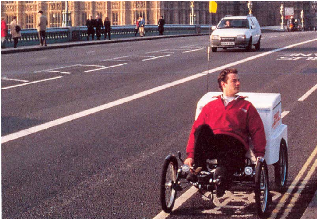
Recumbent cycle user

Where proposed interventions raise concerns about the impact on equality of opportunity, early engagement with relevant user groups and preparation of an Equality Impact Assessment (EqIA) are recommended.