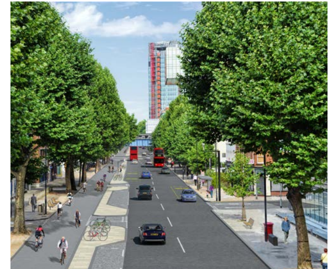
Visualisation of the North-South route

The Superhighways will be delivered to high standards. With the proviso that nothing must reduce cyclists' right to use any road, segregation will be favoured. Where it is not possible to separate with kerbs and where justified by traffic conditions, light segregation and wide, mandatory cycle lanes will be considered. Tackling junctions to provide safer and more comfortable conditions for cyclists is a priority, separating cyclists from other traffic in time and space.