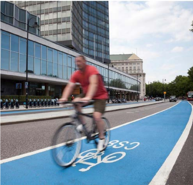
Mandatory cycle lane on a 'connector'

While it is important to ensure that cycle intervention is appropriate for the street type, it is also important to provide continuity for cyclists along a route. A strategic overview of a route is required to ensure cycling provision is seamless across street type boundaries.