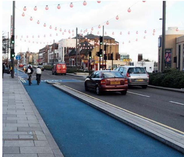
Full segregation on CS2 extension

The aim of Superhighways is to improve cycling conditions for people who already commute by cycle, and to encourage new cyclists, thereby contributing to the growth set out in the Mayor's Vision for Cycling.