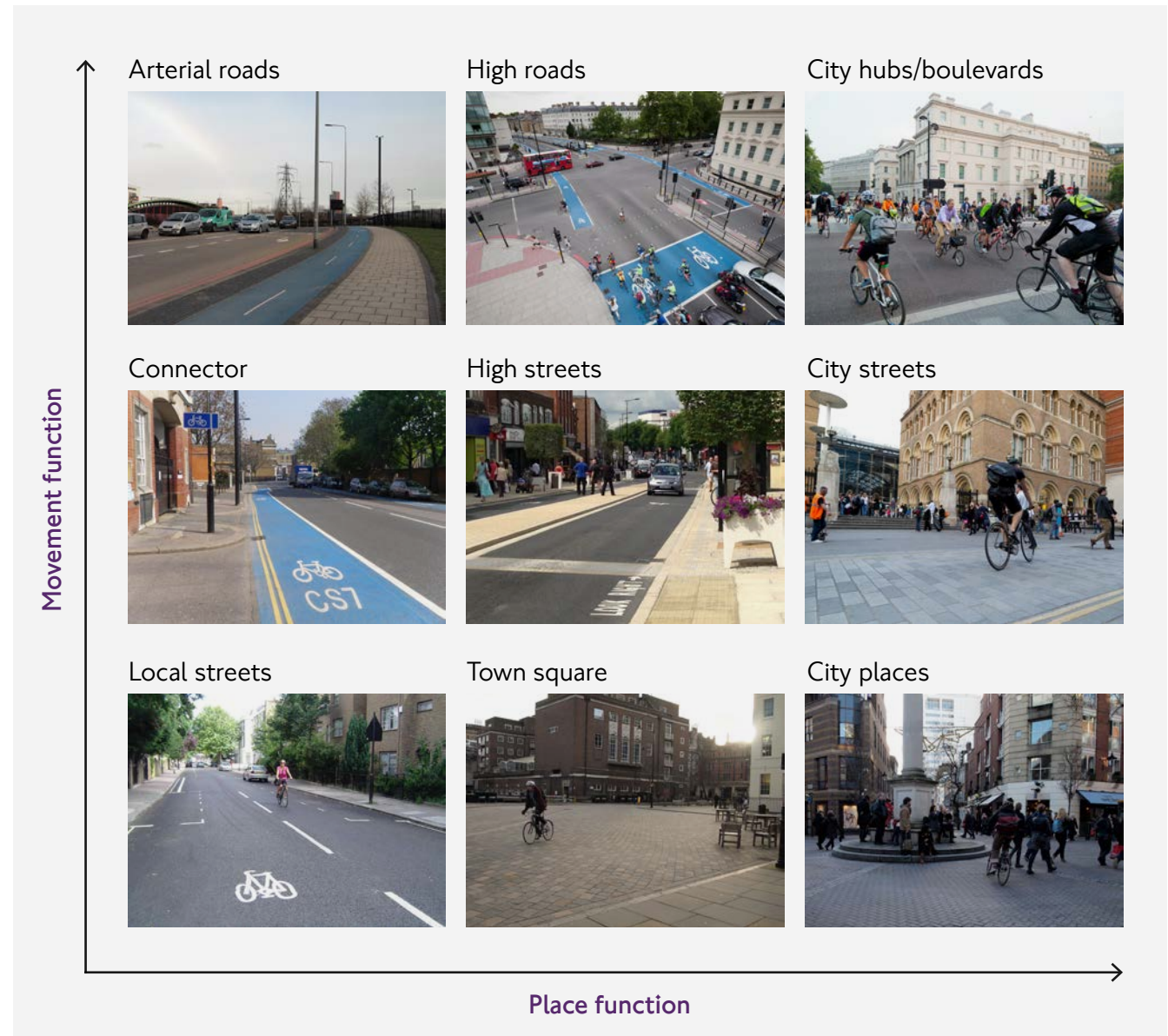
Figure 1.3 Cycling infrastructure that may typically feature in each street type

The adoption of street types across neighbouring highway authorities will play an important role in providing a unified view on where best to apply different measures.